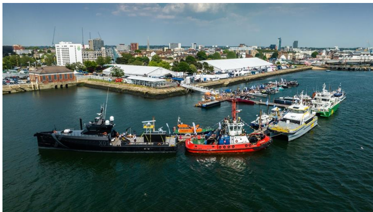
Seawork in 2023