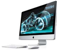
Apple iMac 27"

System Rent A. Kreitz KG T.: +49 (0) 151-27528882 e-mail: imex@system-rent.de